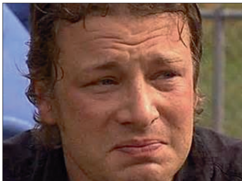
Jamie Oliver hears about BHW